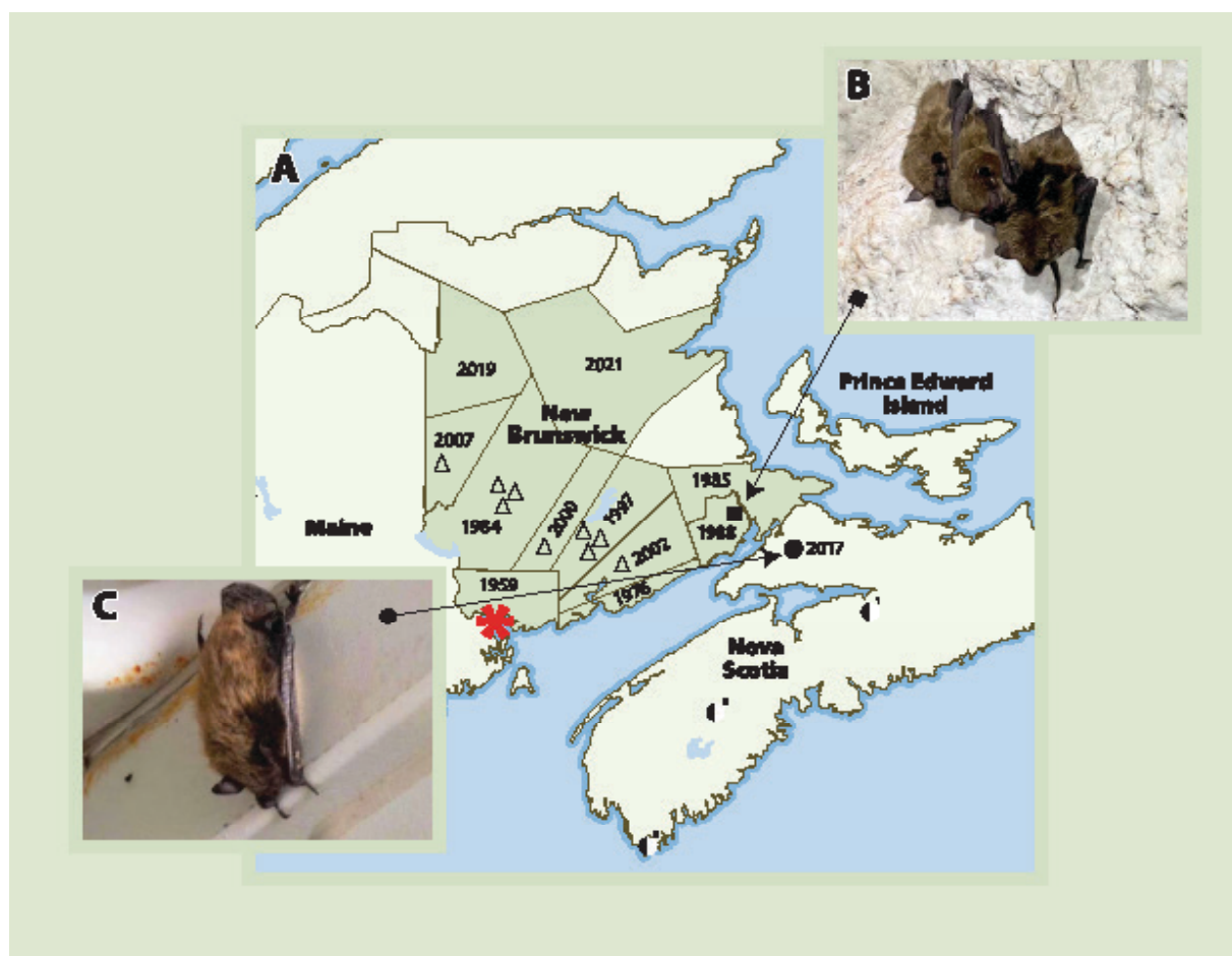
Fig. 2 - A). Distribution of the Big Brown Bat in Maritime Canada 1959-2020. The asterisk marks the first confirmed report (1959). Shaded counties are those from which Big Brown Bats have been recorded based on specimens or photographs, with the year of first reported occurrence noted. Triangles mark the location of maternity colonies. Closed square marks underground hibernacula. Closed circle marks the single confirmed Nova Scotia occurrence, while half-closed circles mark an unconfirmed sighting 1 and hypothetical reports from acoustic surveys 2. B). A cluster of three Big Brown Bats ( Eptesicus fuscus) over-wintering in Sayre Mine, Albert County, New Brunswick, on 6 April 2022. C). The single verified record of the Big Brown Bat ( Eptesicus fuscus) for Nova Scotia to date is a September 2017 image from Oxford reported in the media.

The first confirmation of Big Brown Bats overwintering in underground hibernacula in New Brunswick occurred on