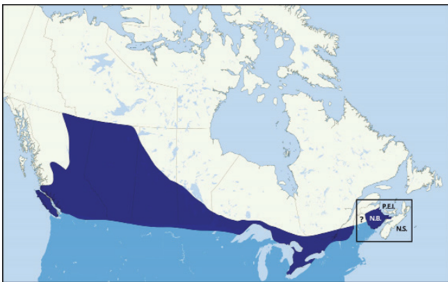
Fig. 1 - The Canadian range (dark blue) of the Big Brown Bat ( Eptesicus fuscus ). Northern USA range is shown in light blue. The species reaches its northern range limit in Canada. The study area, incorporating the Canadian Maritime Provinces of New Brunswick (NB), Prince Edward Island (PEI), and Nova Scotia (NS), is enclosed by the rectangle. Shading is modified from van Zyll de Jong (1985), Kurta & Baker (1990) and Lausen et al. (2022) and includes new range data presented below.

From 2009–2015 we surveyed over-wintering bats in 10–15 caves and mines across southern New Brunswick by tracking number of individuals and species present. Very little of New Brunswick provides the bedrock geology suitable for the formation of natural solution caves (McAlpine 1983). Details on survey methodology can be found in Vanderwolf et al. (2012) and Vanderwolf & McAlpine (2021). No Big Brown Bats were observed over-wintering in caves or mines in New Brunswick during this period, or during earlier, less systematic surveys conducted during the 1970s and early 1980s (McAlpine 1983). We also surveyed occurrence records for bats available for the adjacent Maritime Provinces of Nova Scotia and Prince Edward Island (Fig. 1). Together the three provinces make up most of the Atlantic Maritime Ecozone, an area in eastern Canada of diverse geology, regional climate and vegetation characterized by hills and coastal plains. It is the third most forested ecozone in Canada. Although extant forest is largely mixed stands of conifers and deciduous species, this forest is mostly secondary or tertiary growth on old clearcuts and abandoned farms (McAlpine & Smith 2010).